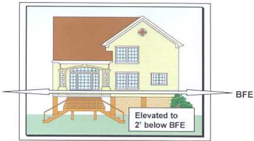
Figure 4. Repaired – variance allowed Elevated to 2 feet below BFE; actuarial premium: $1,930.00 (A zone) or $2,460.00 (V zone)