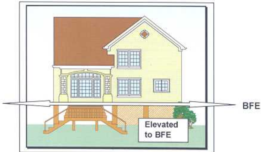
Figure 5. Repaired – no variance allowed Elevated to BFE; actuarial premium: $566.00 (A zone) or $1,440.00 (V zone)