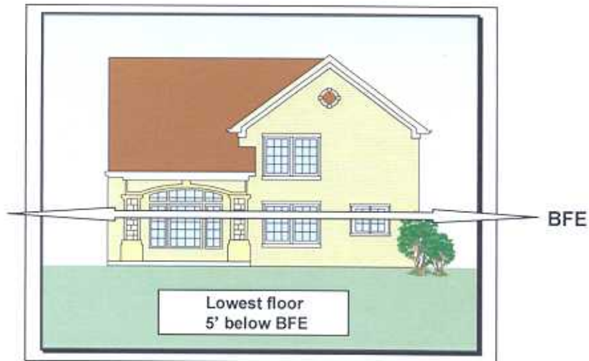
Figure 1. Pre-FIRM – insurance annual premium: $655.00 (A zone) or $1,040.00 (V zone)

construction and lowest floor elevation, and should be computed case-by-case when rating structures for flood insurance. (The community should ask a local agent to provide insurance premium information to be included in the variance packet.)