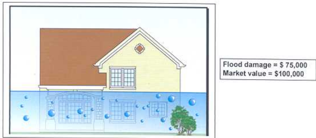
Figure 2. Pre-FIRM – substantially damaged by flood