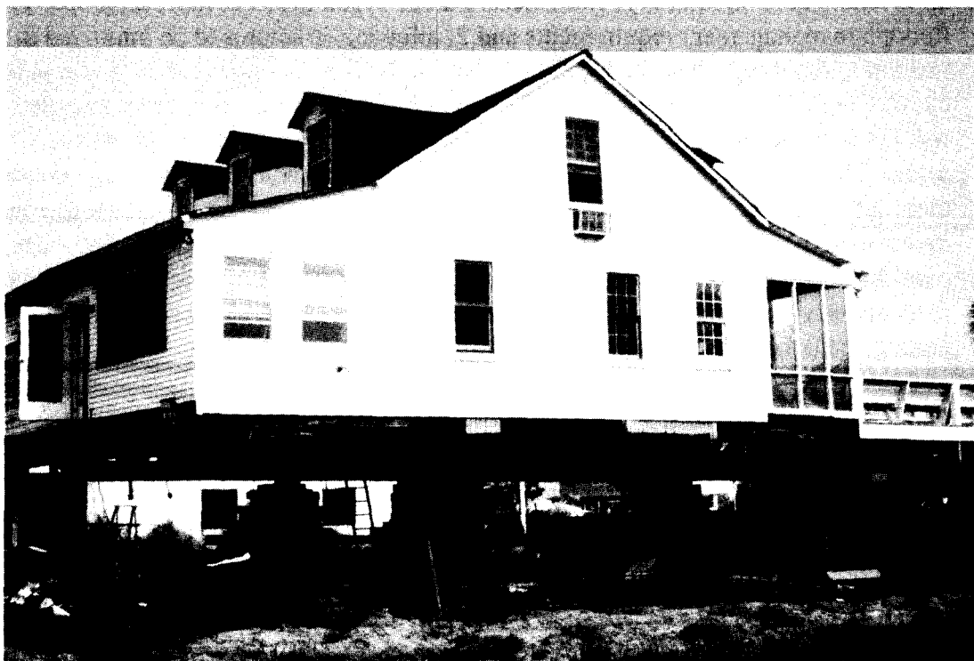
Figure 1. Photograph of a Pre-FIRM structure located on Sullivan's Island, South Carolina which was substantially damaged during Hurricane Hugo. NOTE: The structure has been repaired and is in the process of being elevated to or above the base flood elevation in accordance with NFIP requirements for substantial improvement (Refer to Question No. 9).

FEMA has established a procedure for the flood insurance policies directly written by the NFIP called Post Flood Underwriting. Under this procedure, if a building claim is 50 percent or more of the building's value, the claim is referred to the NFIP's underwriters. At renewal time, the policyholder must submit a new flood insurance application with an elevation certificate. The building is then rated as a Post-FIRM building. The Write Your Own (WYO) Companies that participate in the NFIP are required to have similar underwriting procedures.