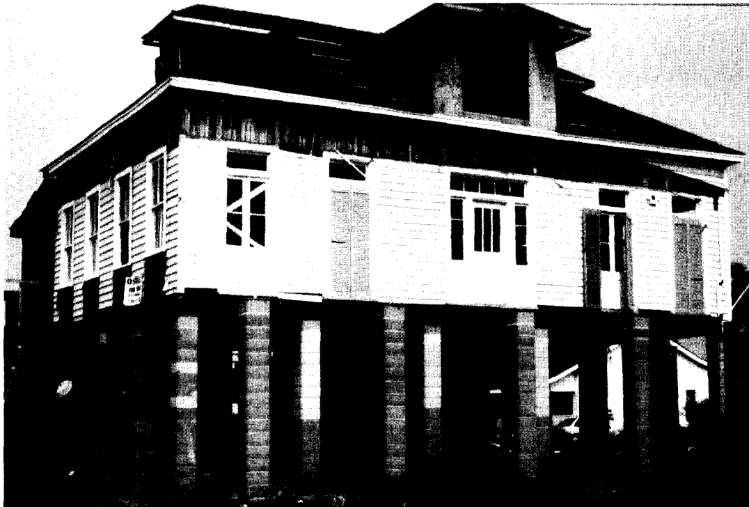
Figure 3. Photograph of a Pre-FIRM structure located on Sullivan's Island, South Carolina which was substantially damaged during Hurricane Hugo. NOTE: The structure is in the process of being repaired and has been elevated to or above the base flood elevation in accordance with NFIP requirements (Refer to Question No. 14).

A. If a substantially damaged structure is located in a coastal high hazard area (V-Zone) it not only must be elevated to or above the base flood elevation, but it also must comply with additional requirements contained in 60.3(e) of the NFIP regulations. These requirements call for the elevation to be on pilings or columns so that the bottom of the lowest horizontal structural member of the lowest floor is elevated to or above the base flood level. This pile or column foundation supporting the structure must also be anchored to resist flotation, collapse and lateral movement due to the combined effects of wind and water loading forces which equal the 100-year mean recurrence interval. Before the permit to repair or rebuild a substantially damaged structure in a V-Zone is granted, a registered professional engineer or architect must develop, review and certify that the structural design, specifications and plans for the construction are in accordance with accepted standards of practice for meeting the above requirements for V- Zone foundations and anchoring.