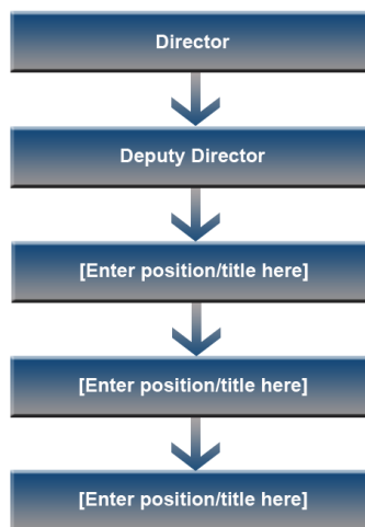
FIGURE 2-2: [ORGANIZATION NAME] ORDER OF SUCCESSION FOR DEVOLUTION

In the event of the unavailability of the Director, [Organization Name], the incumbents of the following positions in the sequence indicated in Figure 2-2, will, if available, exercise the functions and duties delegated, as set forth above. Persons appointed on an acting basis or on some other temporary basis, to the positions listed in Figure 2-2, below, are ineligible to serve. Figure 2-2 illustrates headquarters and regional succession to the position of Director, [Organization Name].