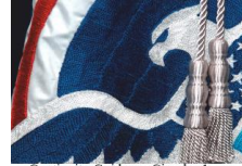
Continuity Guidance Circular 1 (CGC 1) Continuity Guidance for Non-Federal Entities (States, Territories, Tribal, and Local Government Jurisdictions and Private Sector Organizations) June 2009

FEMA guidance and training is supplemented by States that developed CWGs, training, and other guidance.